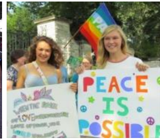
Photos of 2014-17 Campaign Nonviolence actions across the U.S.